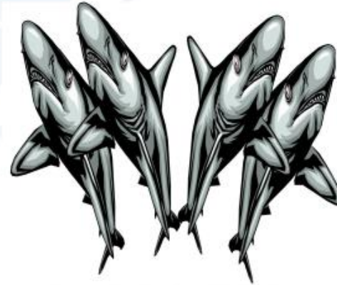
synchronised swimming with sharks